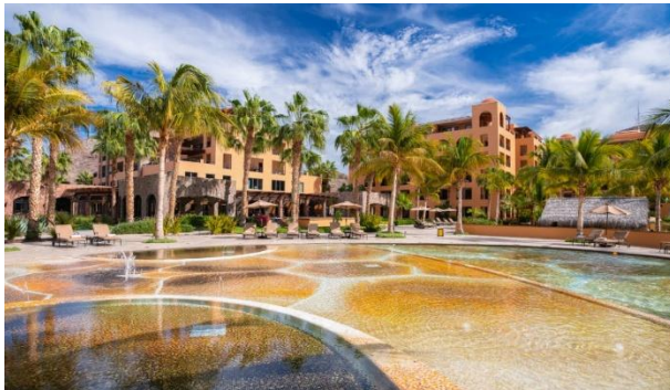
Villa del Palmar Loreto