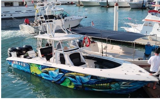
Run N Gun